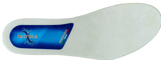
Semelle intérieure Semi-Rigisupplémentaire

The Rehabilitation Line is a modern, customizable, and versatile therapeutic solution, capable of providing maximum support in the home setting to patients with diverse clinical needs—without compromising comfort, functionality, or protection.