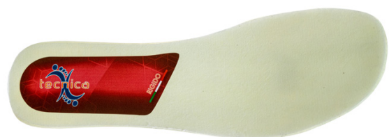
Semelle intérieure Rigisupplémentaire