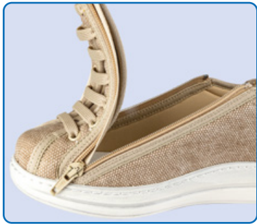
TOTAL OPENING WITH DOUBLE ZIP